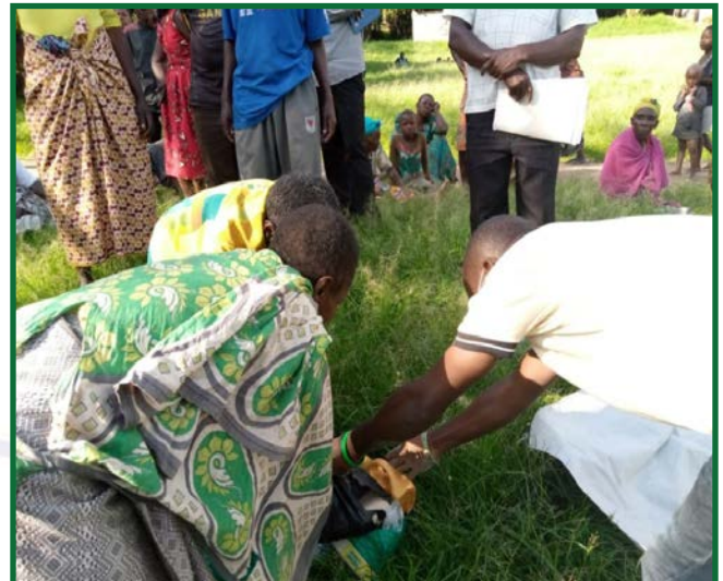
Figure 3: water source and women sharing a jerrycan of water to wash their hands