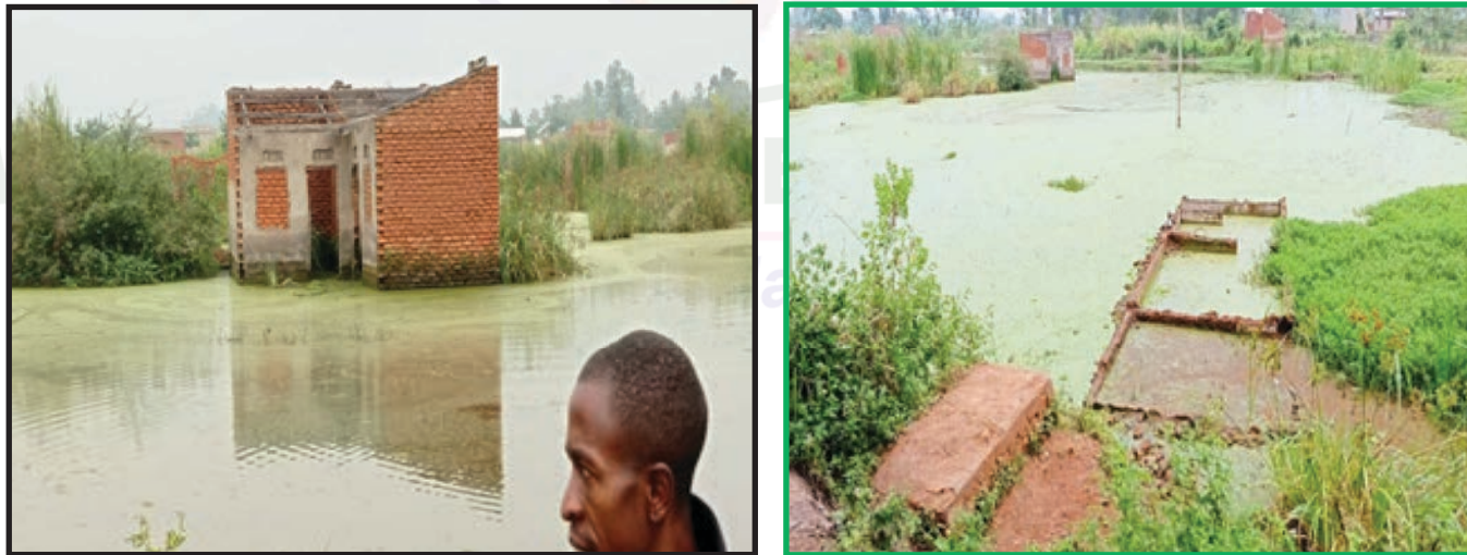
Figure 4: Destroyed households in Kanyangeya Community, Kasese District.

This is attributed to unaffordability and it has resulted into poor sanitation and hygiene within the communities.