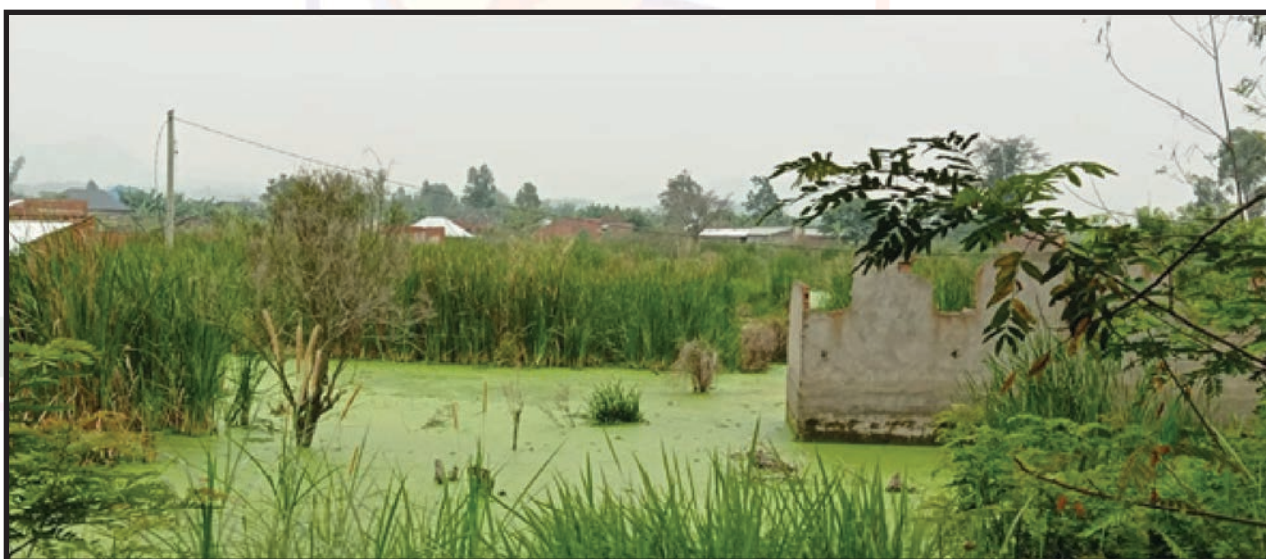
Figure 4: Destroyed power lines in flooded area and People trying to divert flood water from their compounds and houses in Kasese District, Western Uganda.

There is limited lighting within the affected communities partly due to destruction of power lines by floods, absence of power and unaffordability of Pico solar lighting.