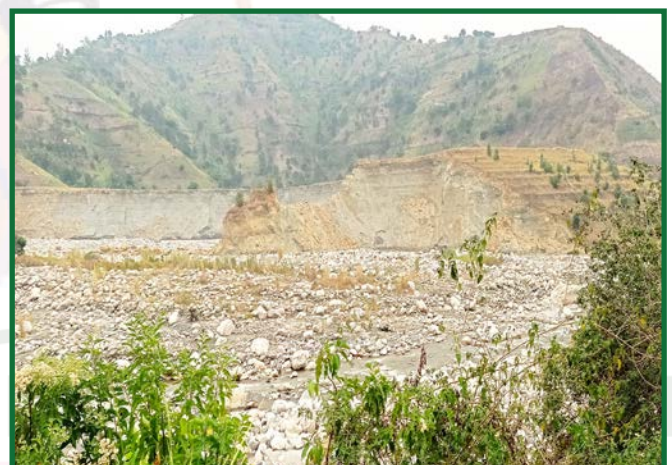
Figure 2: Open banks of the River Nyamwamba