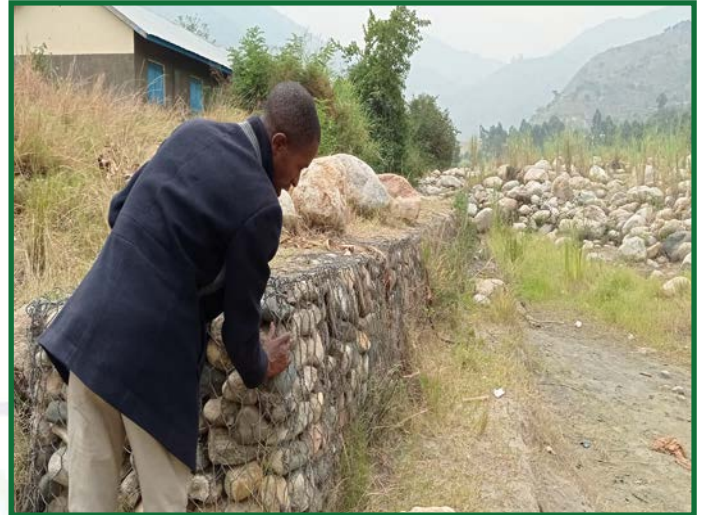
Figure 1: Gabions along some sections of the banks of River Nyamwamba